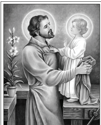
We honor St. Joseph as husband of Mary, and as Patron of the Universal Church.

Yet sometimes our lavish outlay of care seems to go for naught, and even years of exposure to church life do not connect people to the faith in such a way that they make it their own. Thousands upon thousands of people were "raised Catholic" and never got it. How do we respond to them? Are we indignant, or wrathful? Do we dismiss or threaten?